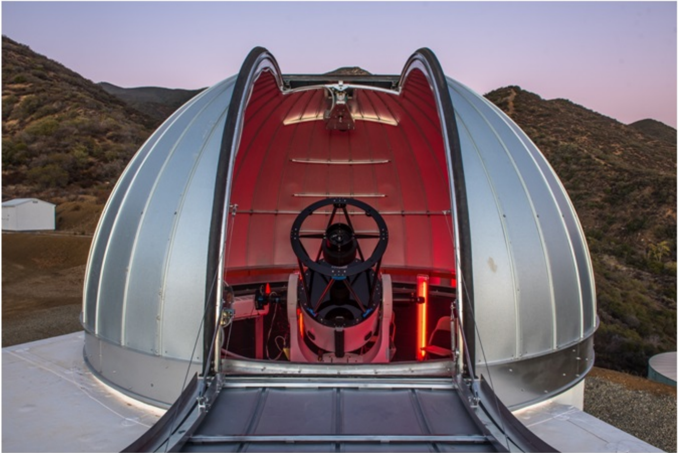
Figure 2. The Thacher Observatory underwent a complete renovation in the fall of 2016, which included installation of a shrink-wrapped and weatherproof roof, a new, fully robotic, Ash Dome, a Plane Wave CDK 700 telescope, and an Andor iKon L-series CCD camera.