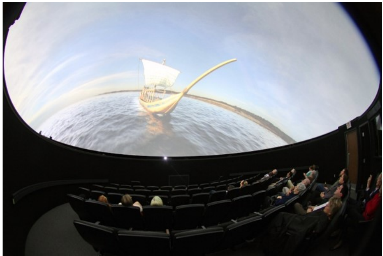
Figure 1. Tarleton Planetarium